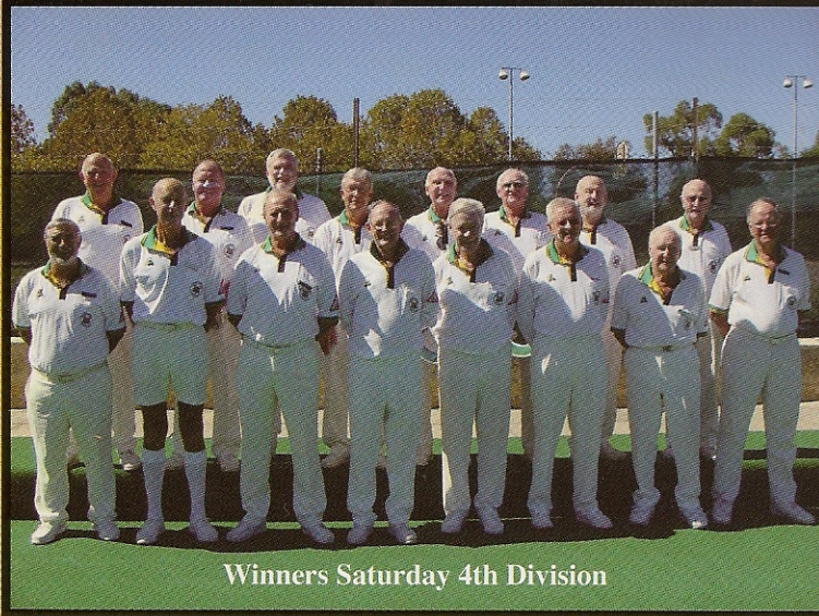
Winners Saturday 4th Division