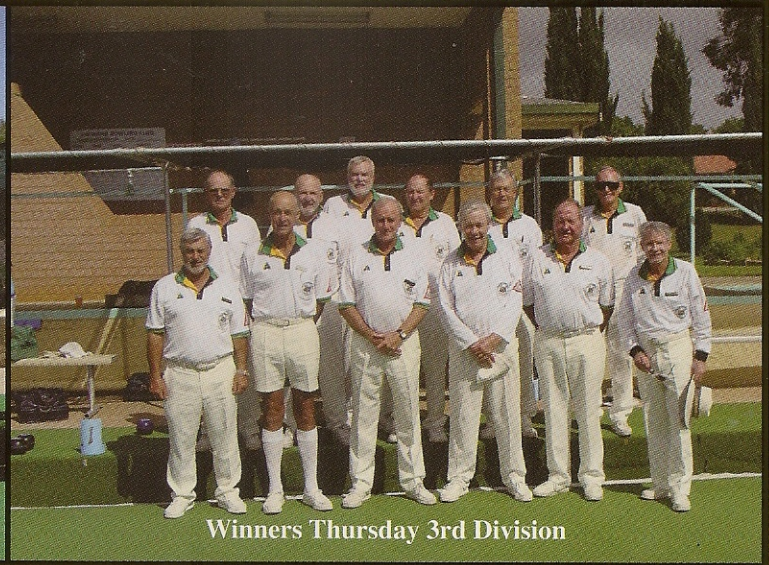
Winners Thursday 3rd Division